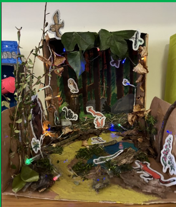
Owen (Yr 2)